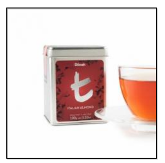
t-Series Italian Almond Tea