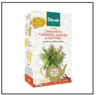
Rooibos Cinnamon, Turmeric, Ginger & Nutmeg