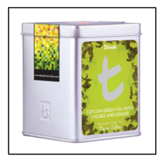
t-Series Ceylon Green Tea with Lychee and Ginger