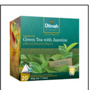
Green Tea with Jasmine