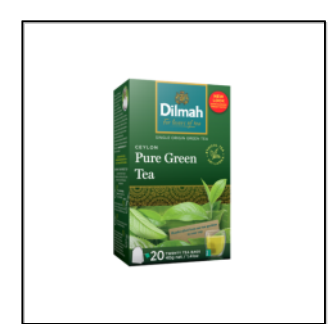
Pure Ceylon Green Tea