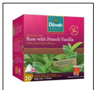
Rose with French Vanilla Tea with natural bael flowers