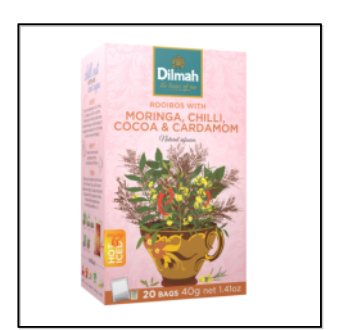
Red Rooibos Moringa, Chilli, Cocoa & Cardamom