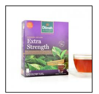
Premium Ceylon Extra Strength