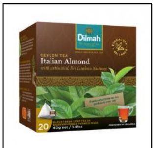
Italian Almond Tea with Sri Lankan Nutmeg