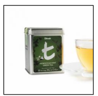
t-Series Moroccan Mint Green Tea