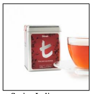
t-Series Italian Almond Tea