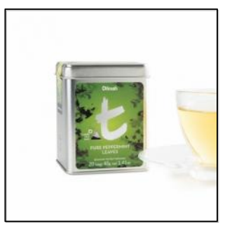
t-Series Pure Peppermint Leaves