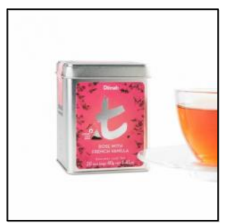
t-Series Rose With French Vanilla