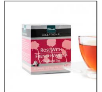
Exceptional Rose With French Vanilla