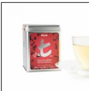
t-Series Sencha Green Extra Special