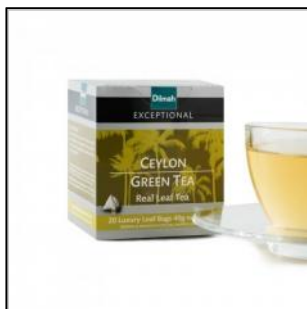
Exceptional Ceylon Green Tea