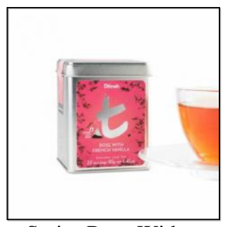
t-Series Rose With French Vanilla