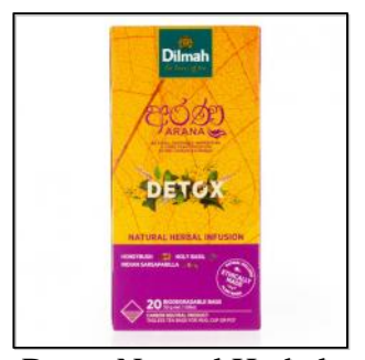
Detox Natural Herbal Infusion