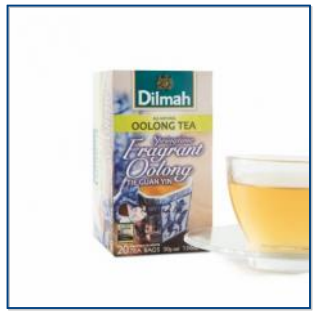
Springtime Fragrant Oolong