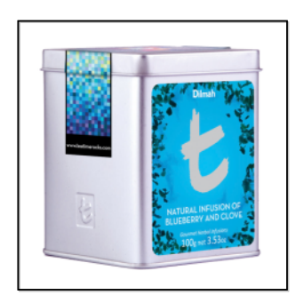
t-Series Natural Infusion of Blueberry and Clove