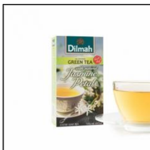
Green Tea with Jasmine Petals