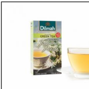
Green Tea with Jasmine Petals