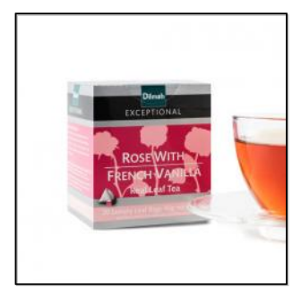
Exceptional Rose With French Vanilla