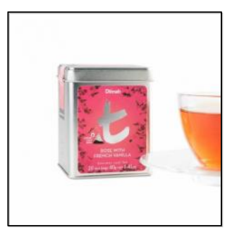
t-Series Rose With French Vanilla