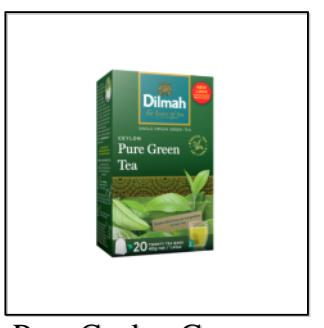
Pure Ceylon Green Tea