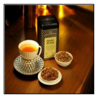
Silver Jubilee Elderflower & Apple Infusion