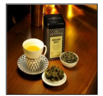
Silver Jubilee Moroccan Mint Green Tea