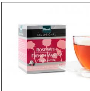
Exceptional Rose With French Vanilla