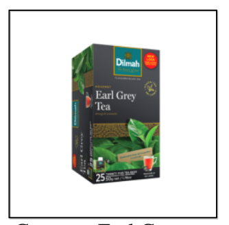
Gourmet Earl Grey