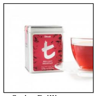
t-Series Brilliant Breakfast