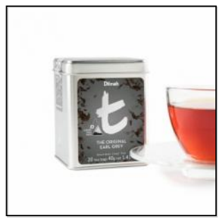
t-Series The Original Earl Grey