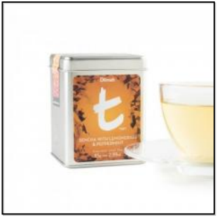
t-Series Sencha with Lemongrass & Peppermint