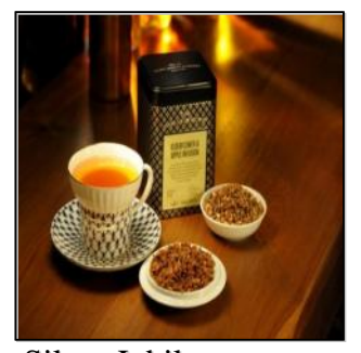
Silver Jubilee Elderflower & Apple Infusion