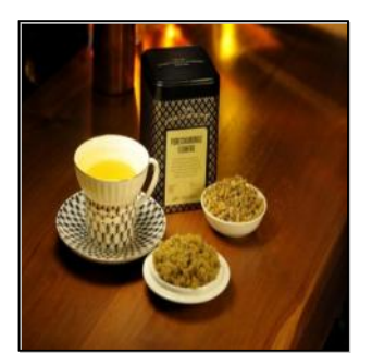
Silver Jubilee Pure Chamomile