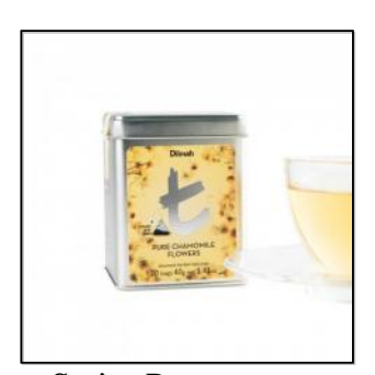
t-Series Pure Chamomile Flowers