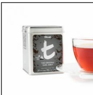
t-Series The Original Earl Grey