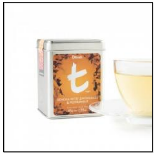
t-Series Sencha with Lemongrass & Peppermint