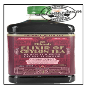
Elixir of Ceylon Tea Black Tea with Lychee