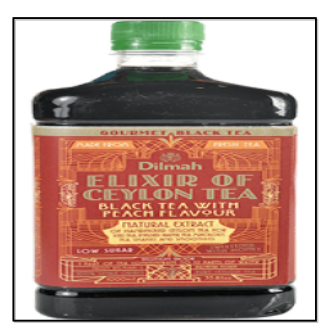
Elixir of Ceylon Tea Black Tea with Peach