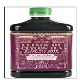
Elixir of Ceylon Tea Black Tea with Rose and Vanilla