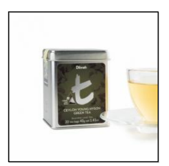
t-Series Ceylon Young Hyson Green Tea