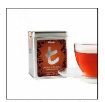
t-Series Lychee with Rose & Almond