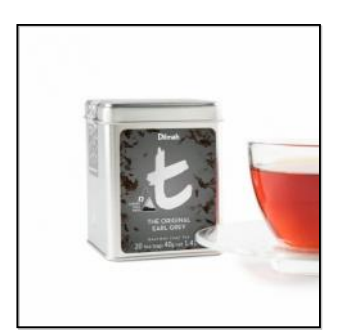
t-Series The Original Earl Grey