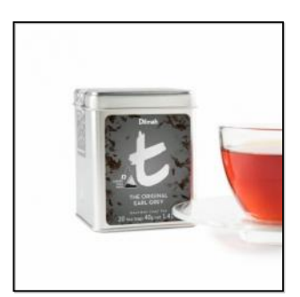
t-Series The Original Earl Grey