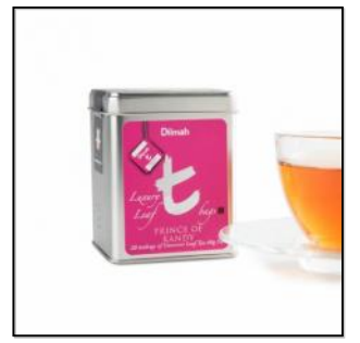
t-Series Prince of Kandy