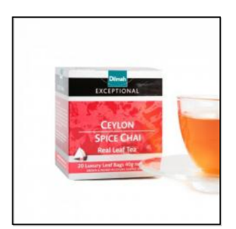
Exceptional Ceylon Spice Chai