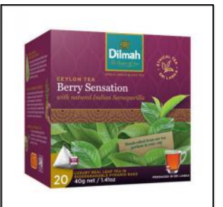
Berry Sensation Tea with natural Indian Sarsaparilla