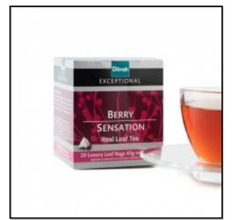
Exceptional Berry Sensation