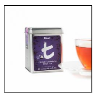
t-Series Ceylon Cinnamon Spice Tea