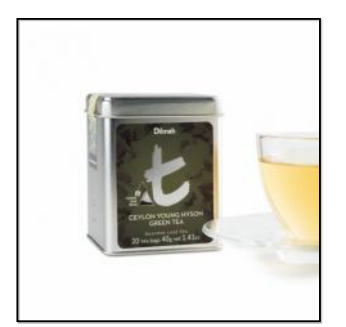
t-Series Ceylon Young Hyson Green Tea