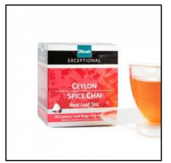
Exceptional Ceylon Spice Chai