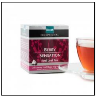
Exceptional Berry Sensation