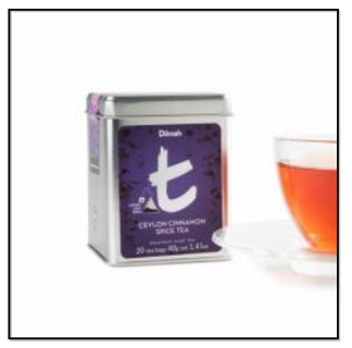
t-Series Ceylon Cinnamon Spice Tea