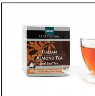
Exceptional Italian Almond Tea