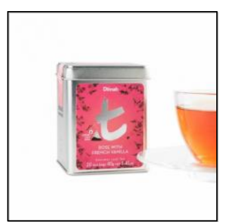
t-Series Rose With French Vanilla