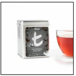
t-Series The Original Earl Grey