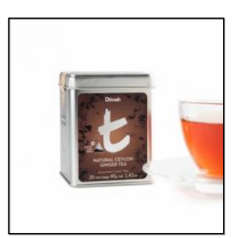
t-Series Natural Ceylon Ginger Tea