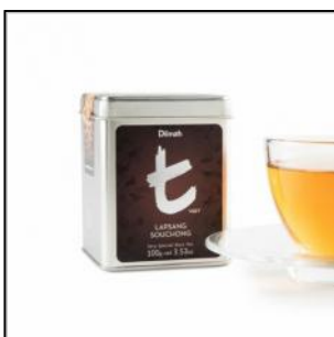
t-Series Lapsang Souchong